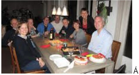
CE2 Potluck Dinner